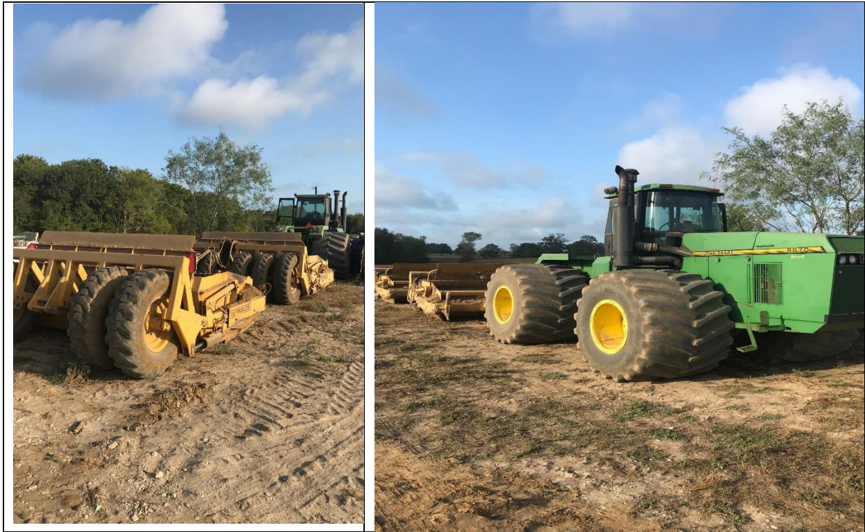
Figure 5. Scrapers used to build the reservoirs.