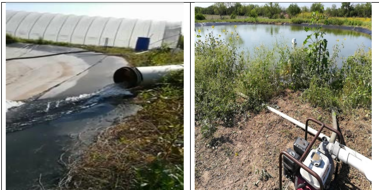
Figure 3. A and B. The reservoir supplied by a pipe from the Irrigation District (A) with a small centrifugal pipe used to extract the water from the reservoir and supply water to the irrigation system.