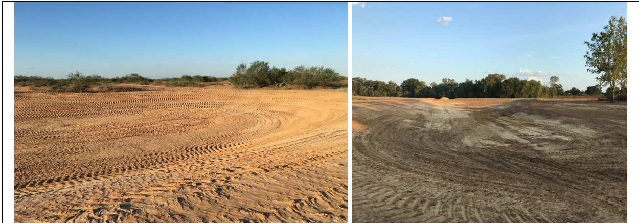
Figure 2. Round reservoir.