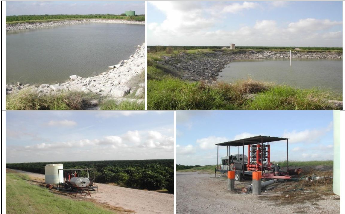
Figure 4. A, B, C and D. Irrigation pump and filters used to apply irrigation to the citrus with water from the reservoir (C and D).

The cost to build an irrigation reservoir will depend on its size. For small acreage producer that have around 10 acres, if they sacrifice 0.25 acres, that may be a good tradeoff. If the size is more significant for example around 125 acres, a right size reservoir can be around 3 to 4 acres. In 2018, the cost of building the reservoir varied from $1.5 to $2.5 per cubic yard (1 cubic yard = 0.764555 m 3 ). The reservoir should store some water to irrigate the field for at least 30 days without irrigation. Farmers must keep in mind that that irrigation district may want to have flexibility on delivering the water. This delivery can be every 2 to 4 weeks depending on the irrigation district. The reservoir can be built with scrapers or bulldozers