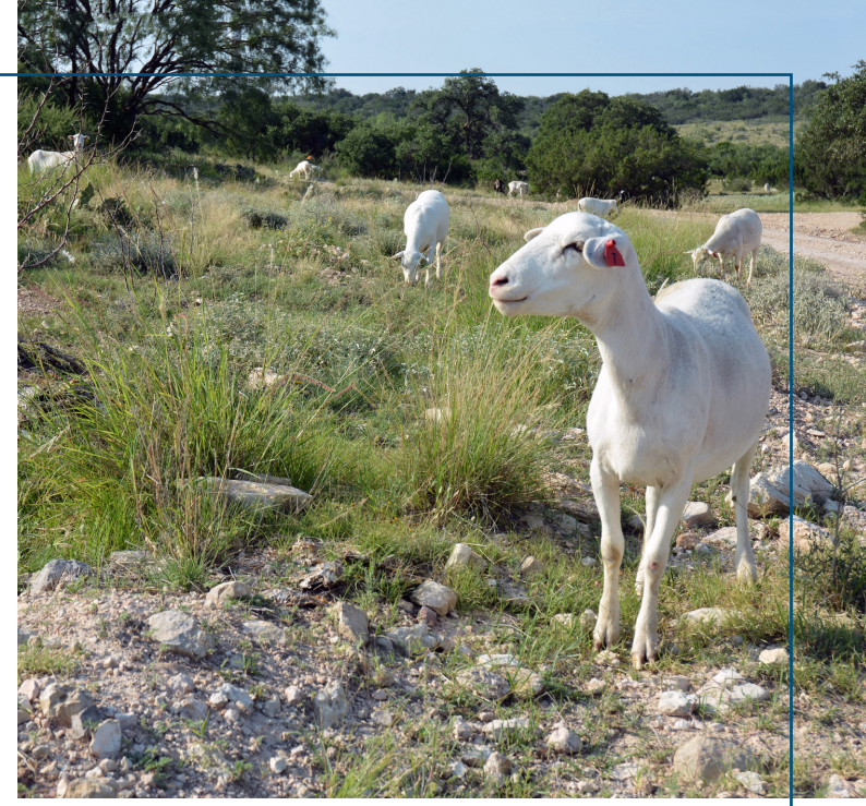
Sheep in West Texas native pasture.

Each year, the AgriLife Extension district economists prepare budgets for various districts across Texas, based on a variety of crops. The Texas Crop and Livestock Budgets for each district